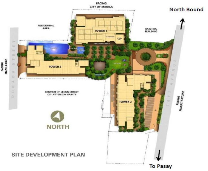
SITE DEVELOPMENT PLAN