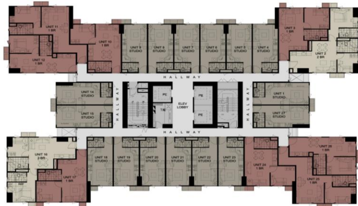
TYPICAL FLOOR PLAN (TOWER 1)