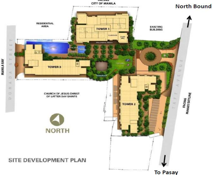
SITE DEVELOPMENT PLAN